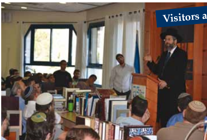
Visitors at Bnei David