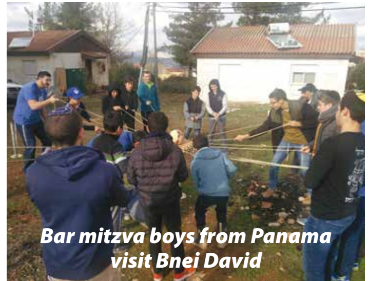
Bar mitzva boys from Panama visit Bnei David

In February some 30 bar mitzva boys from Panama came to Eli to learn about Bnei David. The boys ate lunch with the mechina students, some of whom joined the boys for an afternoon activity highlighting the benefits of working together as a team. We wish all the boys mazal tov as they enter Jewish adulthood and hope they will visit us again. ■